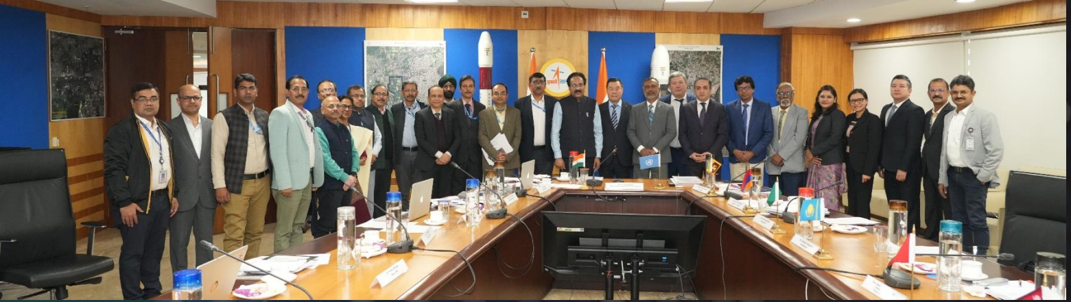
Governing Board Members and Special Invitees during 29 th Governing Board Virtual Meeting held on December 21, 2024