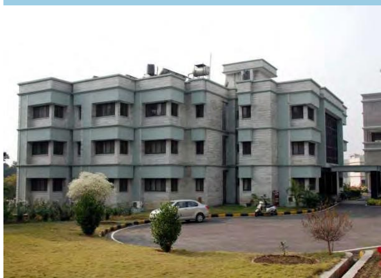
International hostel for course participants at IIRS Dehradun

Master's degree in science or Bachelor's degree in engineering or equivalent qualification relevant in the field of study with at least 5 years of experience in teaching/research or professional experience in the field of natural resources or environment, e.g. agriculture, soils, forestry, ecology, geosciences, water resources, human settlement, land use planning, oceanography, environmental analysis, etc. (For candidates with higher qualifications, the minimum experience may be relaxed). High School-level knowledge in mathematics and/or statistics is essential besides the Master degree as base qualification.