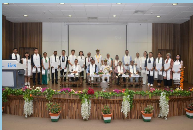
CSSTEAP participants passing out function