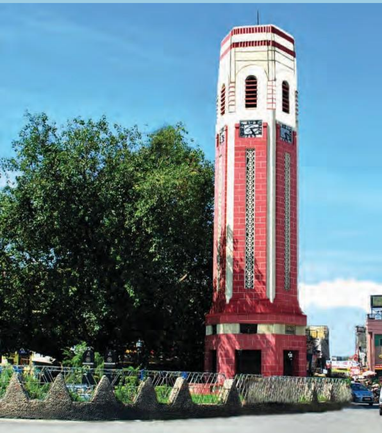
Clock tower landmark of Dehradun city.

Alumni meets are organized to develop a network and to establish meaningful linkages between CSSTEAP, faculty and its past students. Such meets were held in Nepal, Bangladesh, Sri Lanka, Bhutan, Myanmar and Philippines in the past. The center proposes to hold 2-3 such meetings in coming years in different countries with local support.