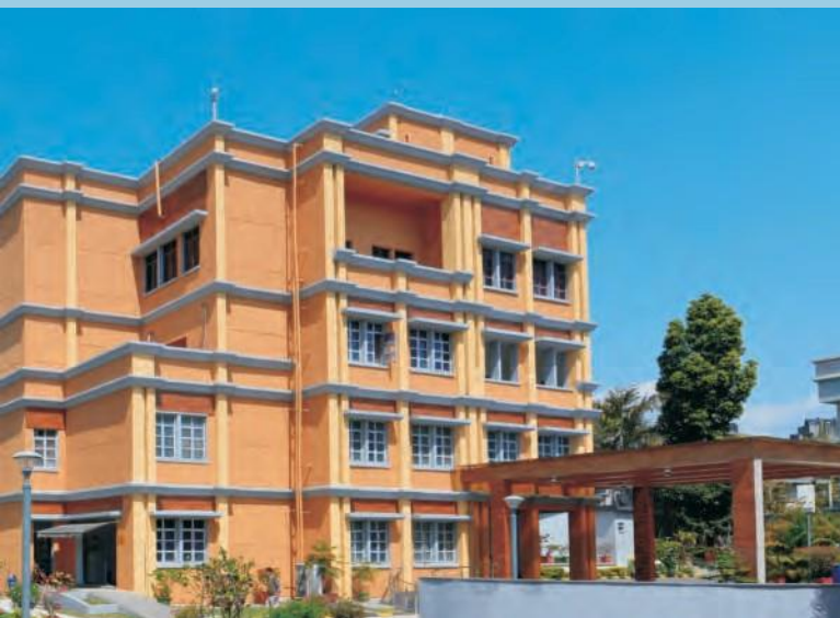
CSSTEAP Headquarters at Dehradun