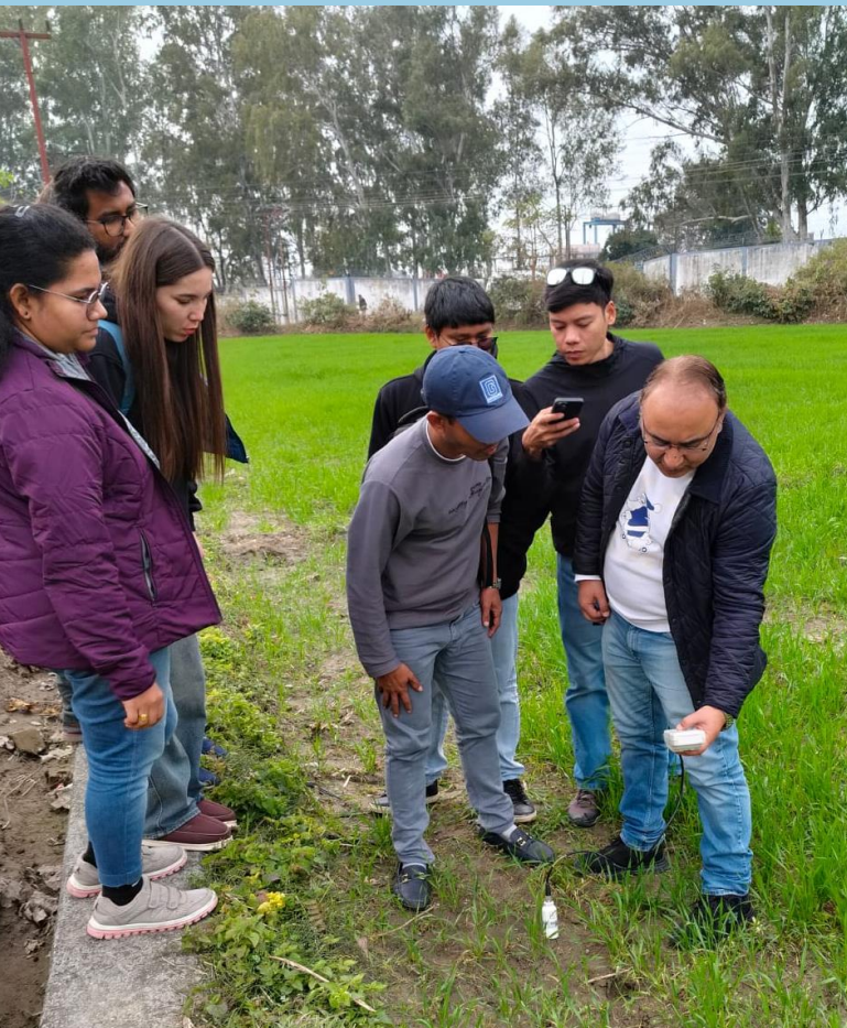
CSSTEAP participants in field visit