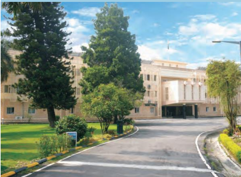
Indian Institute of Remote Sensing (IIRS) Campus, Dehradun

IIRS has so far trained 15433 trainees including 1547 foreign students from various countries of Asia, Africa and Latin America have also benefitted under SHARES Fellowship programme of the Department of Space, ITEC / SCAAP fellowship scheme of the Ministry of External Affairs, Government of India, other fellowship schemes, etc. For further details visit www.iirs.gov.in