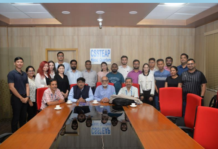
CSSTEAP RS & GIS Participants with Guest Faculty

4007 participants from 39 AP countries and 88 participants other than AP countries