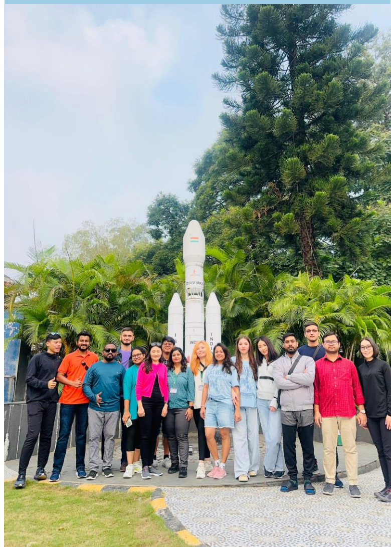
CSSTEAP participants at IIRS Campus

On successful completion of the nine- months course, the participants will be awarded Post Graduate Diploma. Certificate of Attendance will be given to the candidates who fail to clear the examination.