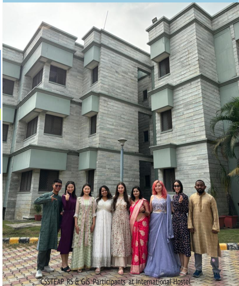
CSSTEAP RS & GIS Participants at International Hostel

(ii) Short Courses: Besides P.G. level courses, the Centre also conducts short term courses of two to four weeks duration in specific themes of above subjects regularly.