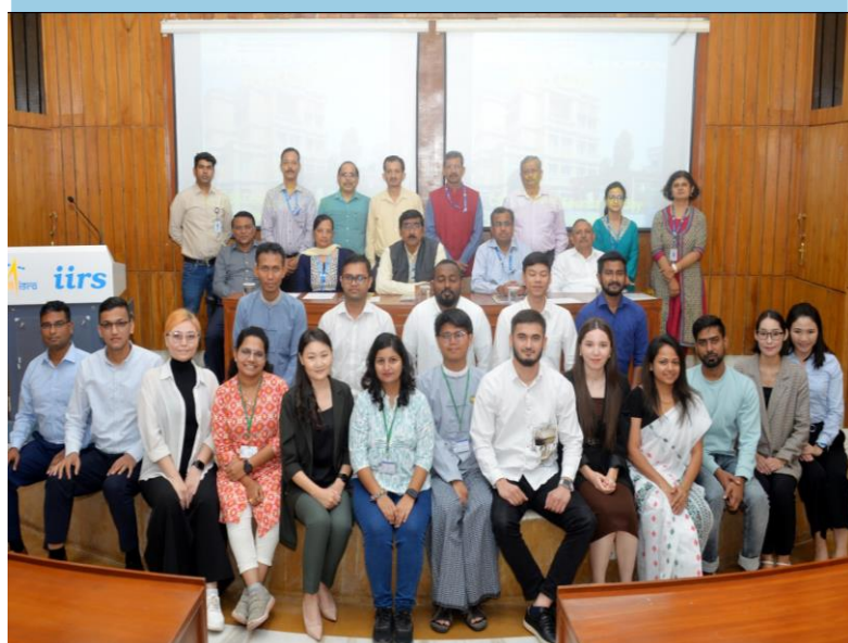
CSSTEAP participants with faculty during CSSTEAP formation day

Living Expenses International Travel Support Single Occupancy Hostel, Sports & Gym 24x7 digital Library Medical facility Course fee waived off English Coaching