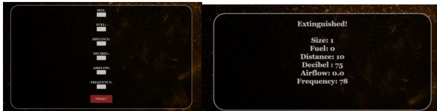
Figure 7: Outputs of fire extinguisher model

extinguisher model, there's again another page dedicated for this in the UI. Once the fire has been detected using the videos, values can be entered into this page. Using the values entered, the predict function predicts if the fire can be extinguished or not. For the below given values, the fire can be extinguished so it gives the output as extinguished. The values entered and the corresponding output is displayed on the webpage in figure 7.