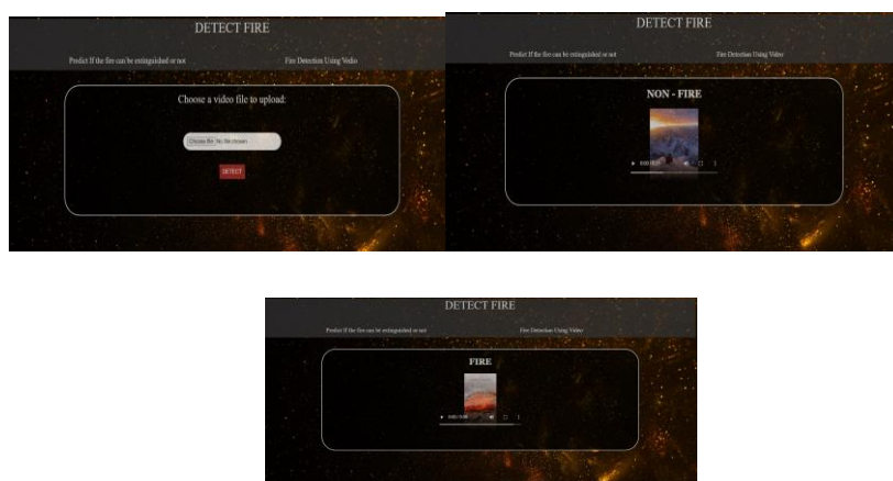
Figure 6: Homepage and Outputs

The web application has a separate page for each model, starting with the home page, which has the basic information needed by the user. Once the video is uploaded, the video is split into frames, and each frame has been checked for fire sequentially. When any one frame contains fire, it stops checking and the output is displayed along with the video. In the second case the first frame generated itself has fire and hence, the output is fire. In the first case, the video only has sunset, which is not been regarded as fire even though it has an orangish-red shade, then the full video is first split. These frames are then resized and fed for prediction. Since there is no frame with fire in it, we get non-fire as output. The outputs are depicted in Figure 6.